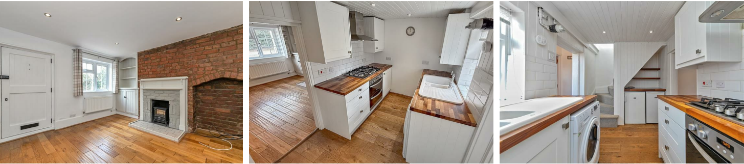
Ground Floor Approx. 271.6 sq. feet

A charming two-bedroom character cottage with a wealth of features including: exposed floorboards, log burning stove and pine stripped doors. The property benefits from gas central heating and double glazing. There is a modern kitchen and downstairs bathroom. To the rear is a private rear garden and two parking spaces available to rent separately. Wheathampstead is a thriving village surrounded by rolling countryside yet close to all major communication links including the Thameslink railway station less than three miles away in Harpenden. There are three primary schools within the village. The new Katherine Warington senior school is less than three miles away.