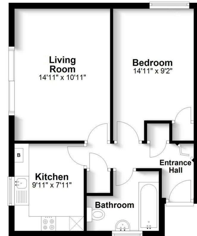
Total area: approx. 498.5 sq. feet

Produced for Cassidy & Tate Estate Agents. For guidance purposes, not to scale.