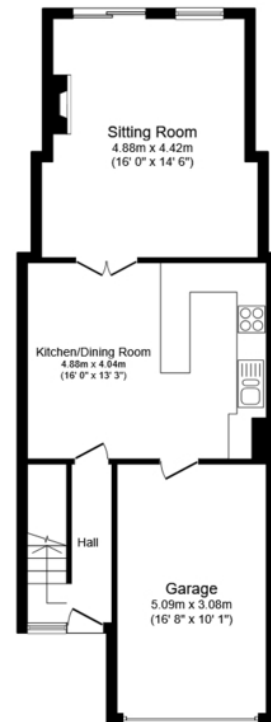
Ground Floor Floor area 62.0 sq.m. (667 sq.ft.)