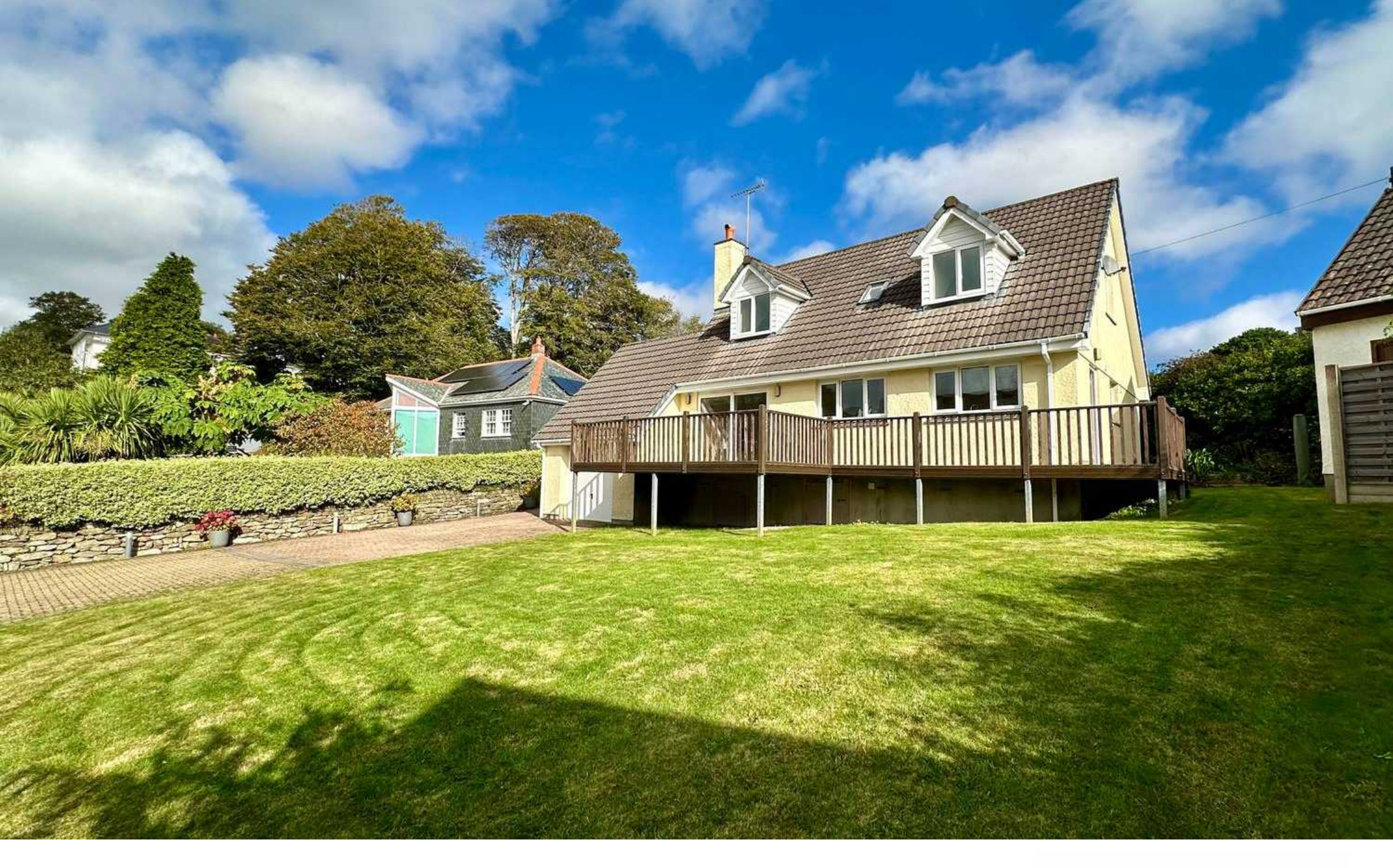
1 Marlborough Meadows Silverdale Road, Falmouth Guide Price £660,000