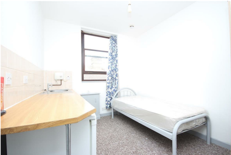
GROUND FLOOR 89 sq.ft. (8.3 sq.m.) approx.