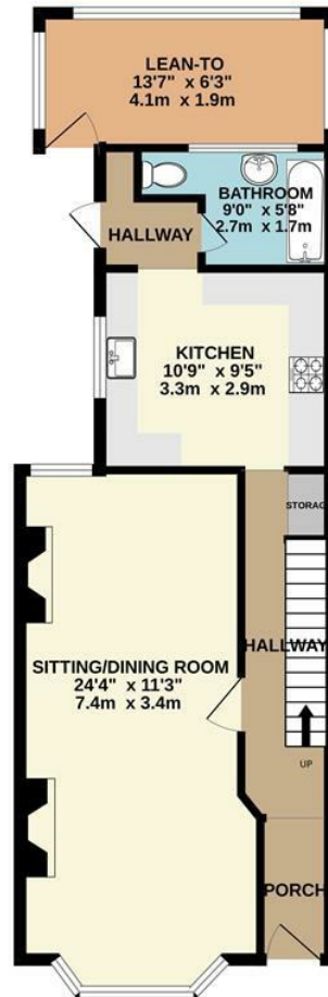
GROUND FLOOR 576 sq. ft. (53.5 sq. m.) approx.