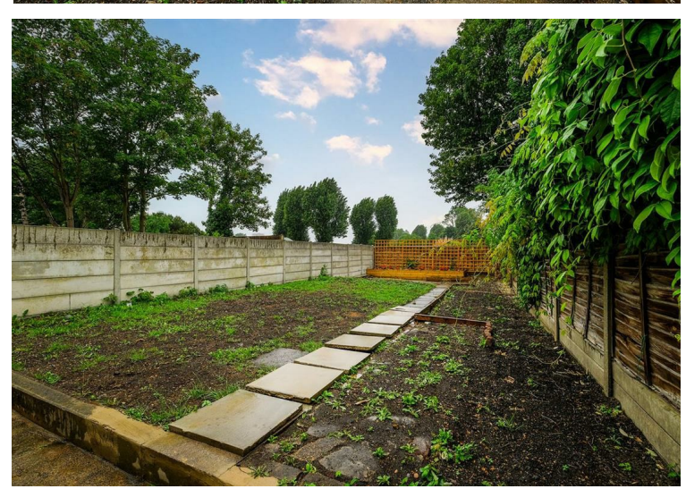
Available Mid June 2025 | Unfurnished

Churchill Estates are delighted to present this beautifully maintained two bedroom second-floor flat, ideally located just a short walk from Leyton Central Line Station.