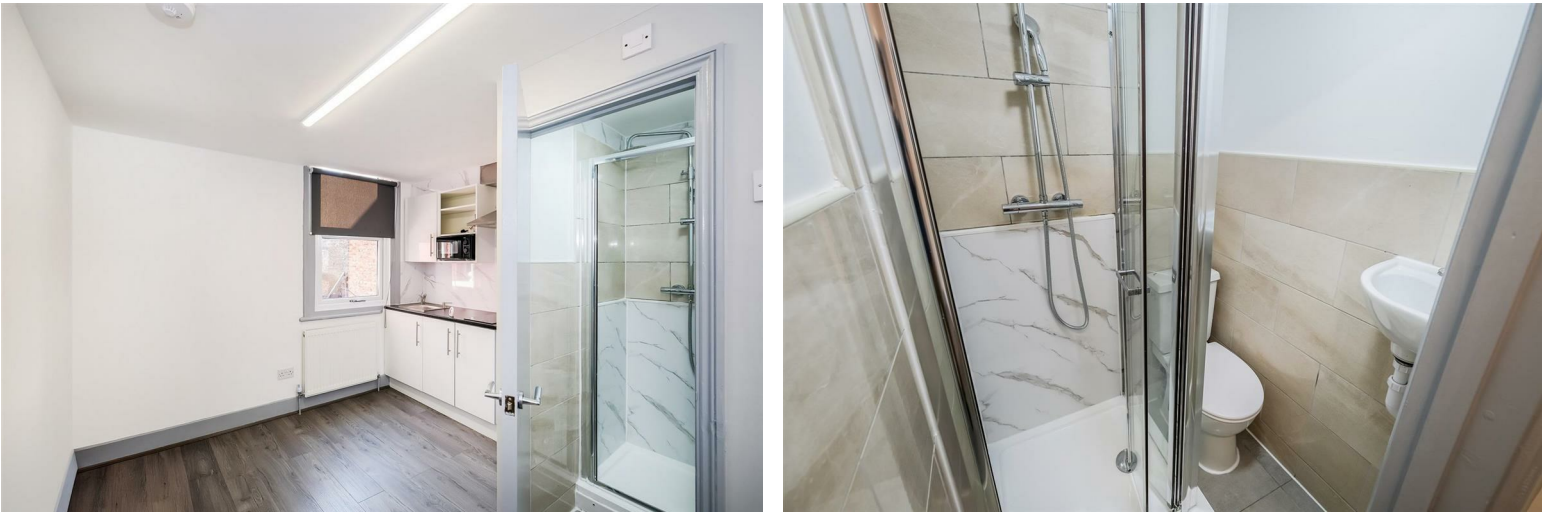
GROUND FLOOR 109 sq.ft. (10.1 sq.m.) approx.