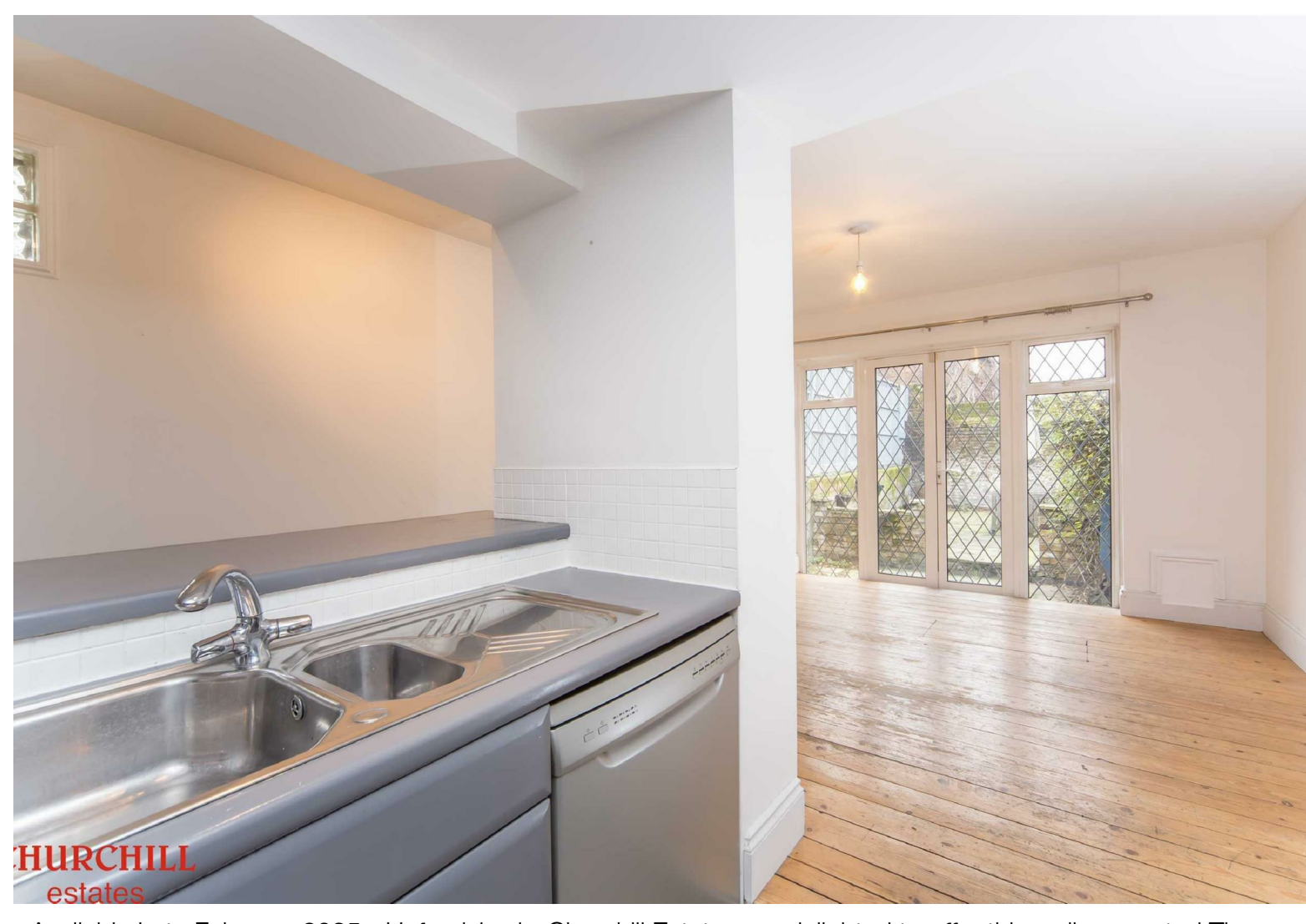
Available Late February 2025 - Unfurnished - Churchill Estates are delighted to offer this well-presented Three Double Bedroom Victorian End Terrace House located moments from the ever-popular Lloyd Park, with views overlooking the William Morris Gallery's manicured lawns and accessible to Walthamstow Central Station & Local Bus/Cycle Routes.

The property has been fully decorated throughout & has accommodation arranged over three floors with the master bedroom boasting a superb en suite shower room in the converted loft space, two double bedrooms and modern first floor bathroom on the first floor and living room, modern kitchen open to dining area and access to private garden on the ground floor.