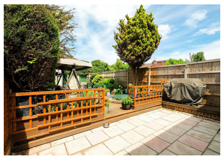
Nestled on the desirable Hampton Road in Chingford, this charming house offers a perfect blend of modern living and spacious comfort. With a generous area of 1,258 square feet, the property boasts two inviting reception rooms, ideal for both relaxation and entertaining guests. The home features four well-proportioned bedrooms, providing ample space for families or those seeking extra room for guests or a home office.

The property includes two contemporary bathrooms, ensuring convenience for all residents. The loft extension adds valuable living space, which can be utilised in various ways to suit your lifestyle. The modern kitchen is a highlight, equipped with the latest amenities, making it a delightful space for culinary enthusiasts. Additionally, a utility room enhances practicality, offering extra storage and laundry