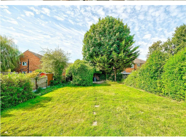
Welcome to Tufton Road, Chingford - a property that truly stands out from the rest! This house is not just your average home; it boasts a much larger size, offering you ample space to create the home of your dreams.

One of the highlights of this property is the impressive 75ft rear garden, perfect for those who love outdoor living or dream of having their own green oasis in the heart of the city. Imagine hosting summer barbecues, gardening, or simply relaxing in this expansive outdoor space.