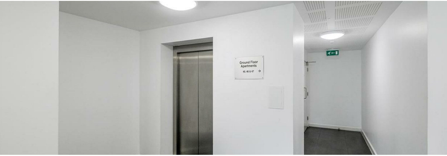
GROUND FLOOR 562 sq.ft. (52.2 sq.m.) approx.