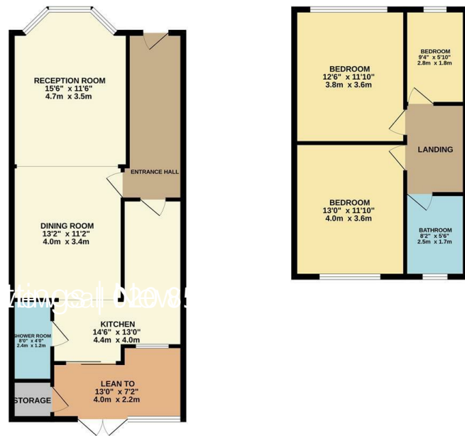
1ST FLOOR 448 sq ft. (41.6 sq m.) approx.

TOTAL FLOOR AREA - 1101 sq ft. (103.2 sq m.) approx. While every attempt has been made to ensure the accuracy of the dimensions contained herein, measurements of items, fixtures, fittings and any other items are approximate and no responsibility is taken for any error, omission or mis-statement. This plan and associated photographs are for illustrative purposes only and do not constitute an offer of any property. The services, systems and appliances shown hereon are for illustrative purposes only and do not constitute an offer of any property. Please contact the agent for further information.