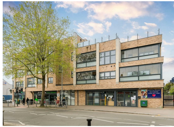
APARTMENT 630 sq.ft. (58.5 sq.m.) approx.