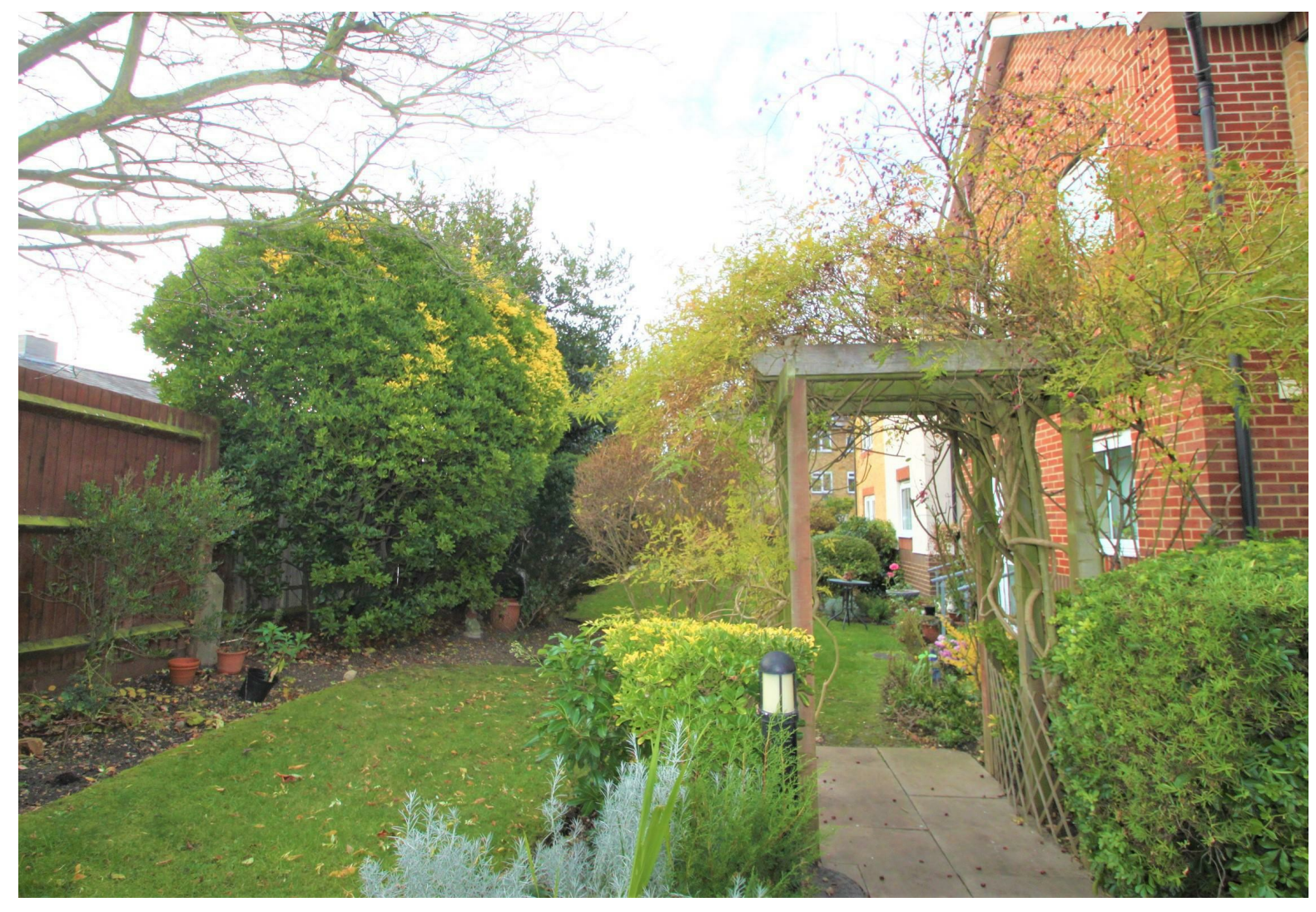
GUIDE PRICE £150,000 A ONE BEDROOM FIRST FLOOR RETIREMENT APARTMENT WITH DOUBLE GLAZING. Kingwood Court was constructed by McCarthy & Stone (Developments) Ltd and comprises 44 properties arranged over 3 floors each served by a communal lift. The Development Manager can be contacted from various points within each property in the case of an emergency. For periods when the Development Manager is off duty there is a 24 hour emergency Appello call system. Each property comprises an entrance hall, lounge, kitchen, one or two bedrooms and bathroom. It is a condition of purchase that residents be over the age of 60 years, or in the event of a couple, one must be over the age of 60 years and the other over 55 years.