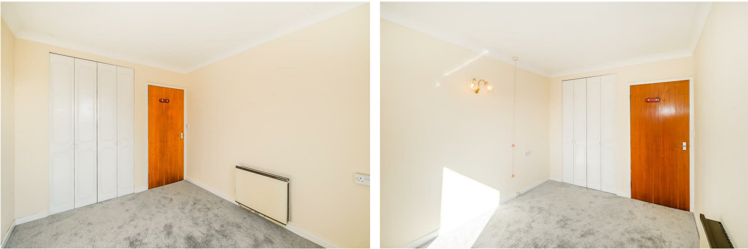
GROUND FLOOR 410 sq.ft. (38.1 sq.m.) approx.