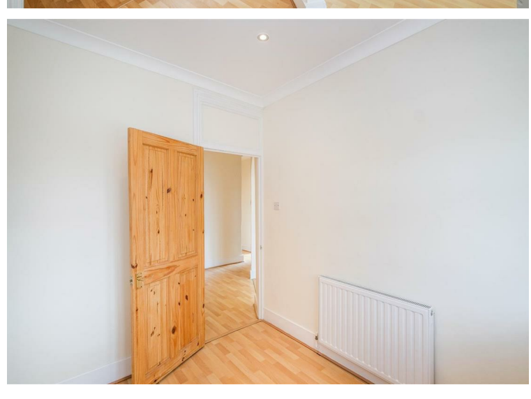
Churchill Estates are delighted to offer to let this all recently refurbished 2 Bedroom first floor maisonette situated in a popular location off Beresford Road being within walking distance to Chingford Main Line Station (zone 5) the property has recently undergone a new refurbishment programme which includes a new kitchen with appliances, laminate wood flooring, bathroom suite with separate WC, Indirect access to rear garden section, offered unfurnished and available now.