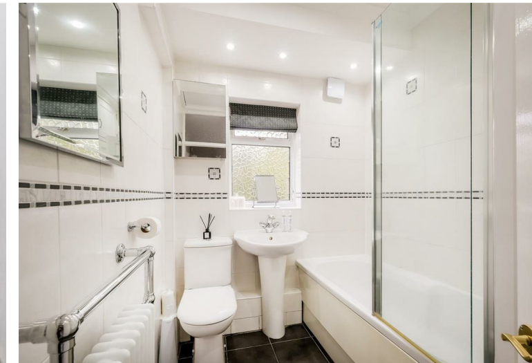
LOOK!! LOOK!! Superbly spacious three bedroom semi detached house which is tucked away in this quiet slip road location and is accessible to the main line station and all local amenities. The property which has been well maintained and modernised by the present vendors benefits from off street parking to front, large gated side access, extended kitchen/diner, large approx 60ft rear garden, first floor family bathroom and an early internal viewing is a must to fully appreciate this fine family home.