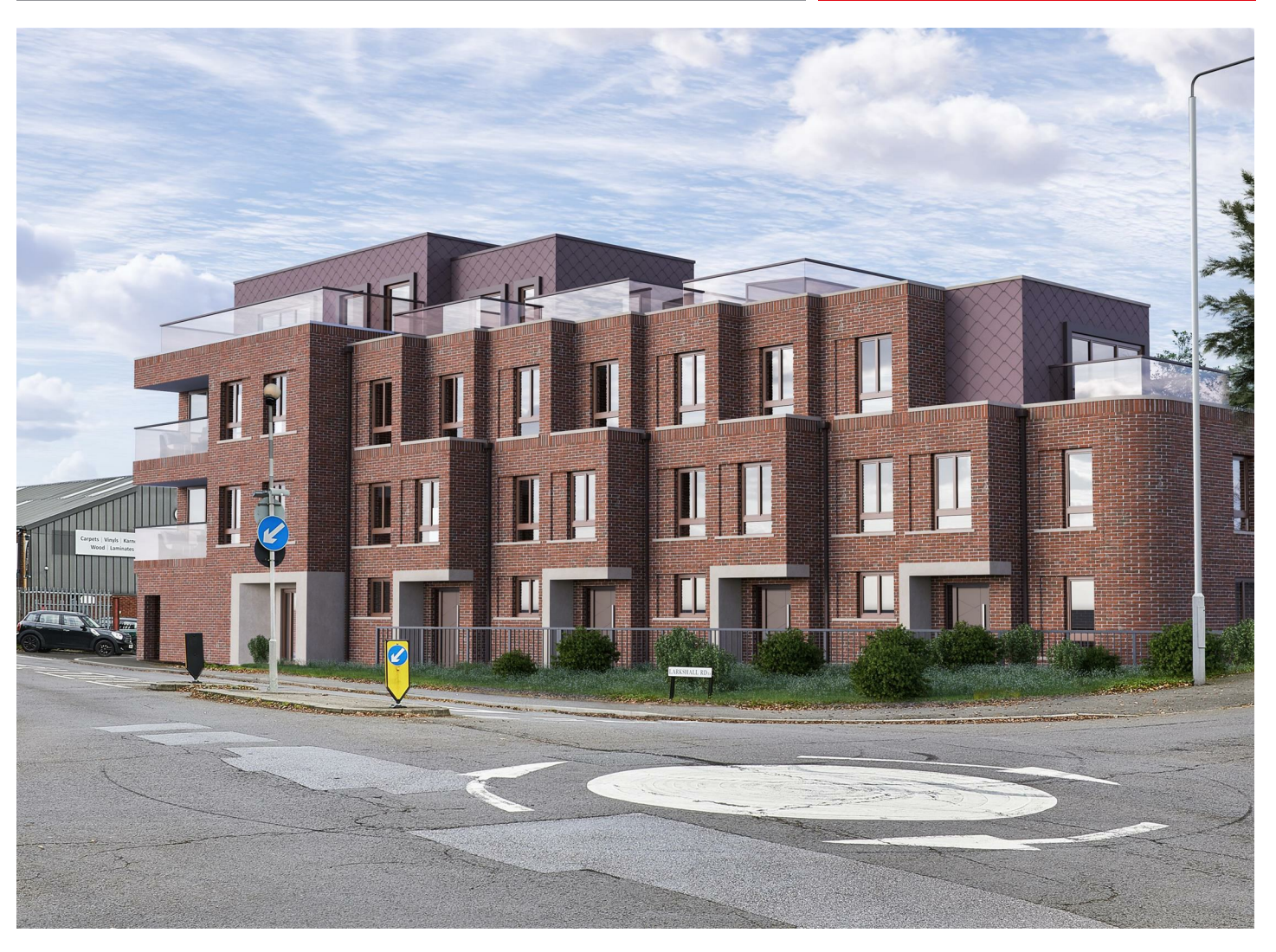
Larkshall Road, North Chingford, E4 6PD £425,000 Leasehold