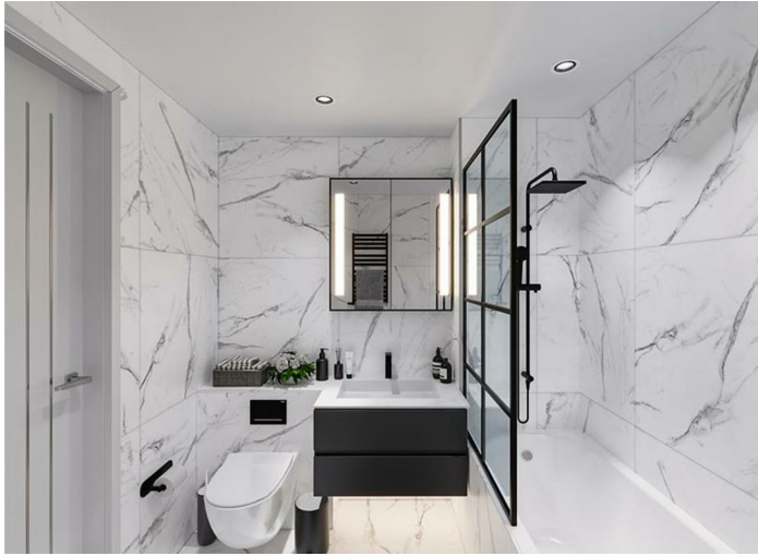
SUPERB NEW DEVELOPMENT of 5 x two and three bedroom apartments which are situated in the sought after North Chingford location and accessible to all local amenities including the main line station which is only approximately thirty minutes into the heart of the City. This property which is 64 square meters benefits from a quality integrated kitchen, balcony, long 125 year lease, large living/kitchen area and we feel would make an ideal first purchase. DUE FOR COMPLETION AUGUST 2024.