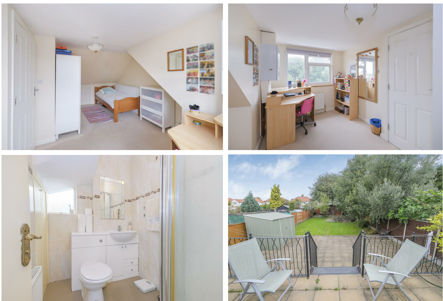
ROOM FOR THE FAMILY!!! Beautiful and spacious three double bedroom, two bathroom semi-detached chalet style bungalow which is situated in the sought after North Chingford location. The property which is being offered with no onward chain benefits from off street parking to front, Large approx 80ft rear garden, ground floor family bathroom, additional first floor shower room, large conservatory and we feel would make an ideal family home.