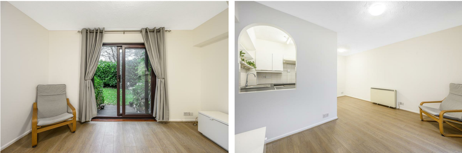
GROUND FLOOR 359 sq.ft. (33.3 sq.m.) approx.