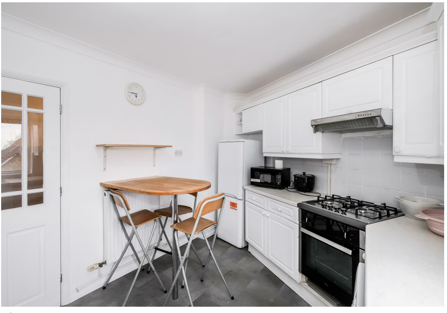
Situated on the second floor is this bright and spacious property which offers two double bedrooms and one single. Also available is a seperate family bathroom and fully fitted kitchen with appliances including, fridge/freezer, oven, hob, and washing machine. The large living area benefits from having a balcony, which offers plenty of natural ight. Walking distance to Buckhurst Hill central line station. Available immediately. Unfurnished.