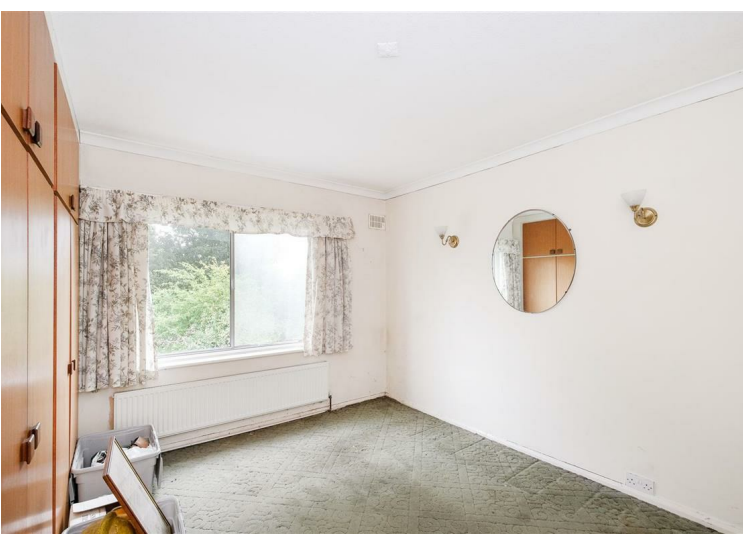
Nestled on Rous Road in the charming Buckhurst Hill, this semi-detached house, being offered on a chain free basis, offers a delightful opportunity for those seeking a new home. Boasting three bedrooms and a well-maintained garden that backs onto the scenic Roding Valley Recreation Ground, this property is a gem waiting to be discovered.

Upon entering, you are greeted by a spacious through lounge, perfect for relaxing or entertaining guests. The galley kitchen with a small dining area adds a touch of warmth to the home, creating a cosy space for family meals. Additionally, the convenience of a downstairs WC adds to the practicality of this residence.