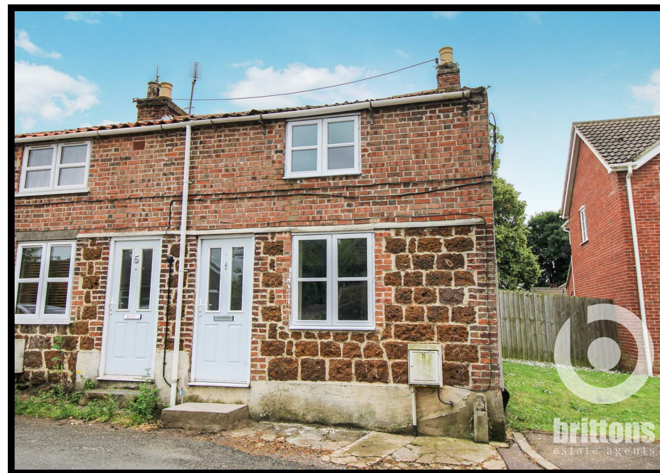
6 Ladysmith Cottages West Winch King's Lynn Norfolk PE33 0LG

IMPORTANT NOTICE: The services, central heating system, together with any appliances included in these particulars have not been tested by the agents and therefore cannot be guaranteed to be in full working order. We advise all prospective purchasers to employ their own independent qualified experts prior to purchase, as we are not qualified to express an opinion on these matters and therefore take no responsibility for their suitability or function.