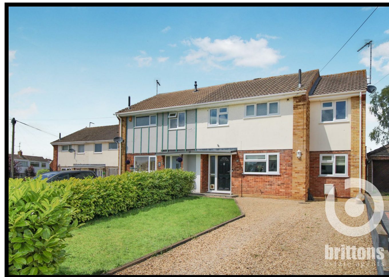
62 Grafton Road King's Lynn Norfolk PE30 3EY

IMPORTANT NOTICE: The services, central heating system, together with any appliances included in these particulars have not been tested by the agents and therefore cannot be guaranteed to be in full working order. We advise all prospective purchasers to employ their own independent qualified experts prior to purchase, as we are not qualified to express an opinion on these matters and therefore take no responsibility for their suitability or function.