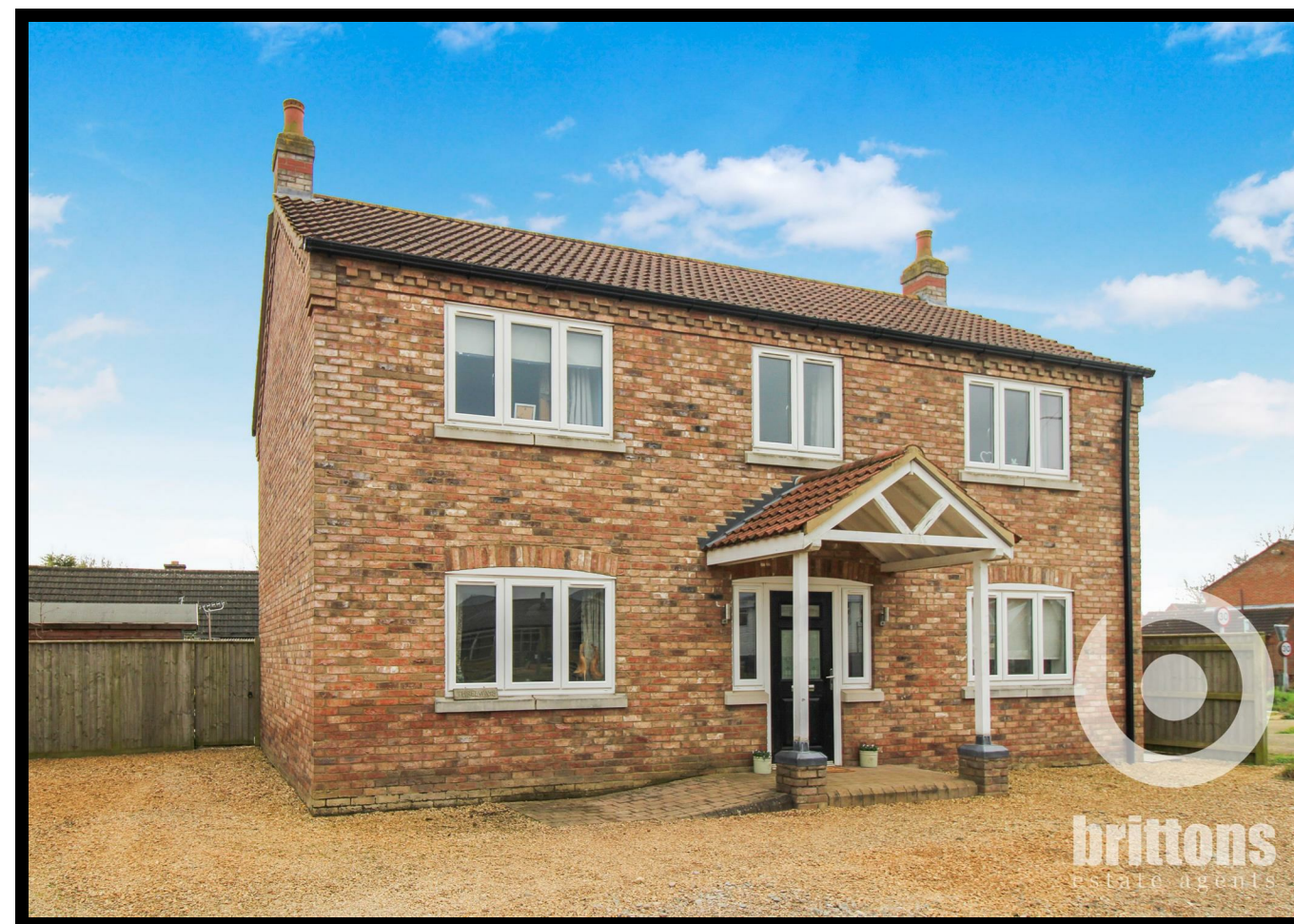
Threeways Lynn Road Walton Highway Wisbech Cambs PE14 7DE SPACIOUS FOUR BEDROOM DETACHED HOUSE WITH DRIVEWAY

IMPORTANT NOTICE: The services, central heating system, together with any appliances included in these particulars have not been tested by the agents and therefore cannot be guaranteed to be in full working order. We advise all prospective purchasers to employ their own independent qualified experts prior to purchase, as we are not qualified to express an opinion on these matters and therefore take no responsibility for their suitability or function.