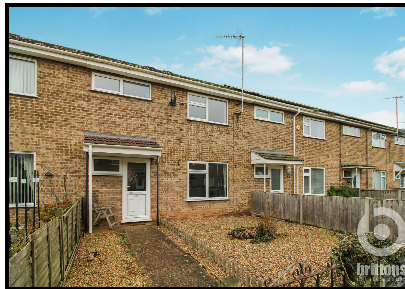
28 Samphire King's Lynn Norfolk PE30 3PH

IMPORTANT NOTICE: The services, central heating system, together with any appliances included in these particulars have not been tested by the agents and therefore cannot be guaranteed to be in full working order. We advise all prospective purchasers to employ their own independent qualified experts prior to purchase, as we are not qualified to express an opinion on these matters and therefore take no responsibility for their suitability or function.