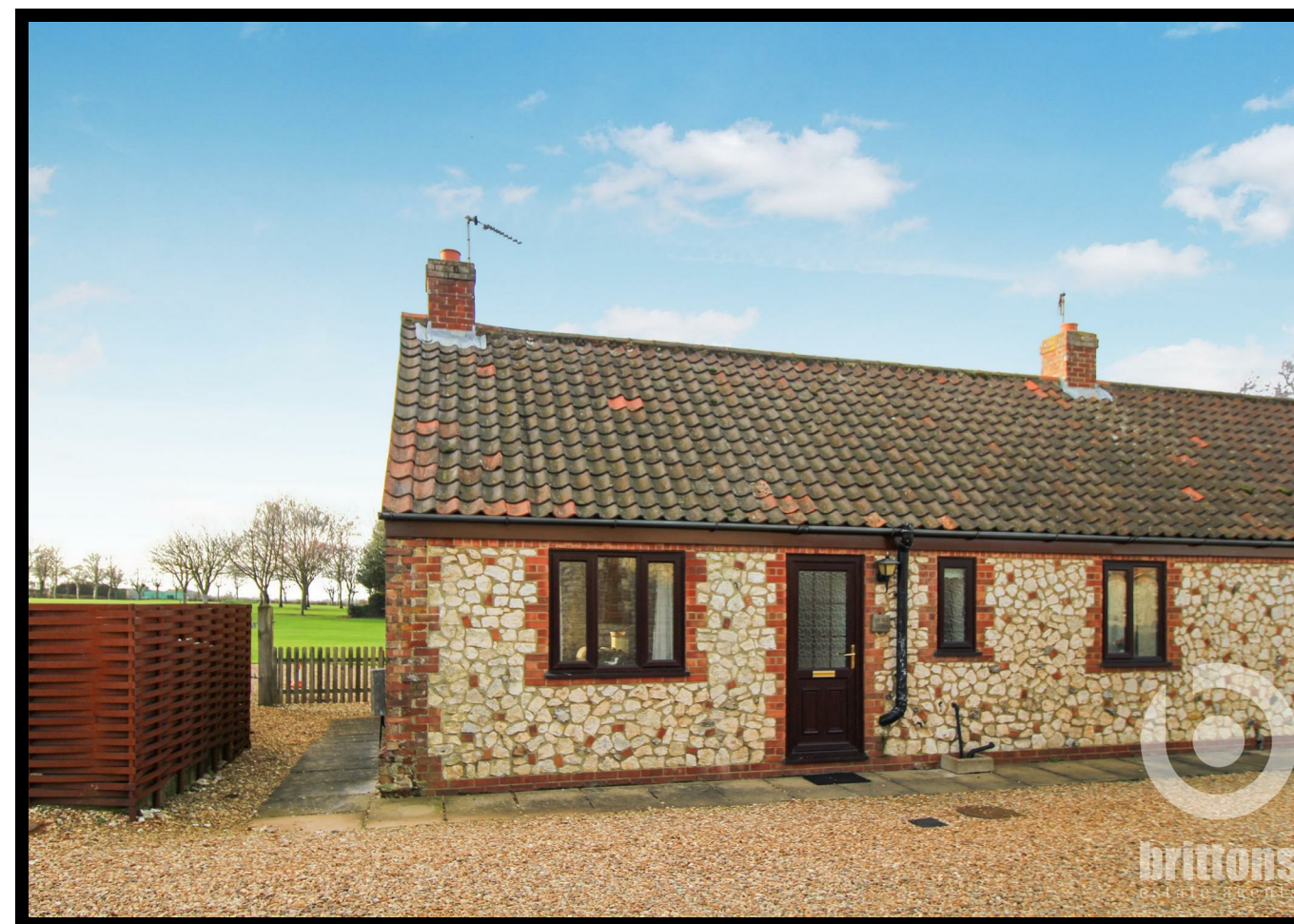
Little Tern Cottage Ringstead Road Thornham Hunstanton Norfolk PE36 6NN

IMPORTANT NOTICE: The services, central heating system, together with any appliances included in these particulars have not been tested by the agents and therefore cannot be guaranteed to be in full working order. We advise all prospective purchasers to employ their own independent qualified experts prior to purchase, as we are not qualified to express an opinion on these matters and therefore take no responsibility for their suitability or function.