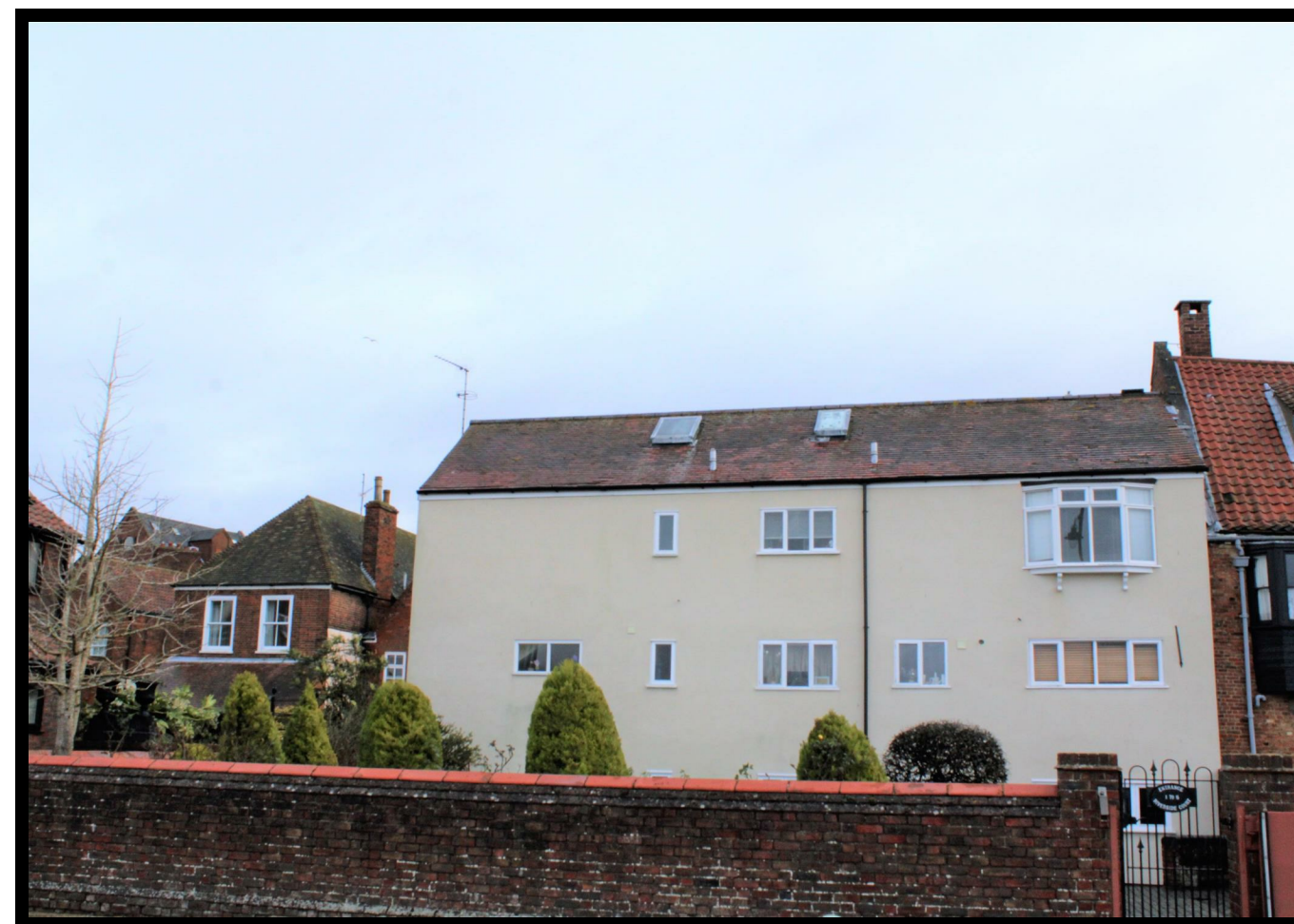
5 Riverside Court South Quay King's Lynn Norfolk PE30 5DB

IMPORTANT NOTICE: The services, central heating system, together with any appliances included in these particulars have not been tested by the agents and therefore cannot be guaranteed to be in full working order. We advise all prospective purchasers to employ their own independent qualified experts prior to purchase, as we are not qualified to express an opinion on these matters and therefore take no responsibility for their suitability or function.