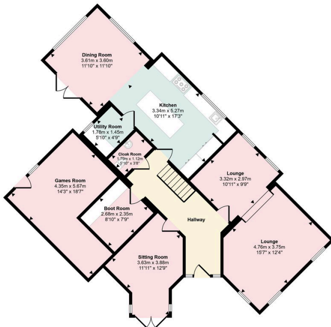
Ground Floor Approx 117 sq m / 1260 sq ft

Approx Gross Internal Area 201 sq m / 2166 sq ft