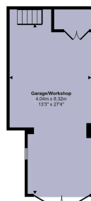
Garage/Workshop Approx 24 sq m / 262 sq ft

This floorplan is only for illustrative purposes and is not to scale. Measurement of rooms, doors, windows, and any items are approximate and no responsibility is taken for any error, omission or mis-statement. Copies of plans such as bathroom suites are representative only and may not look like the real items. Made with Magic Drawings 200.