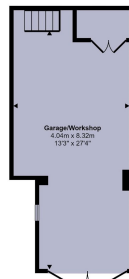
Garage/Workshop Approx 24 sq m / 262 sq ft

This floorplan is only for illustrative purposes and is not to scale. Measurements of rooms, doors, windows, and any items are approximate and no responsibility is taken for any error, omission or mis-statement. Copies of plans such as bathroom suites are representative only and may not look like the real items. Made with Magic Strategy 200.