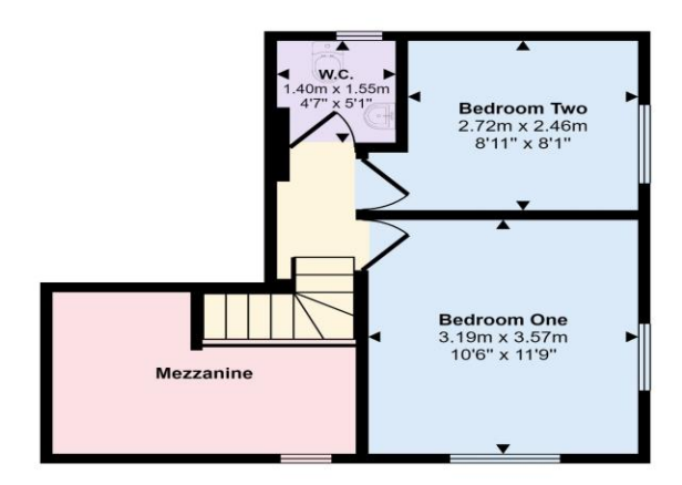
First Floor Approx 25 sq m / 274 sq ft

This floorplan is only for illustrative purposes and is not to scale. Measurements of rooms, doors, windows, and any items are approximate and no responsibility is taken for any error, omission or mis-statement. Icons of items such as bathroom suites are representations only and may not look like the real items. Made with Made Snappy 360.