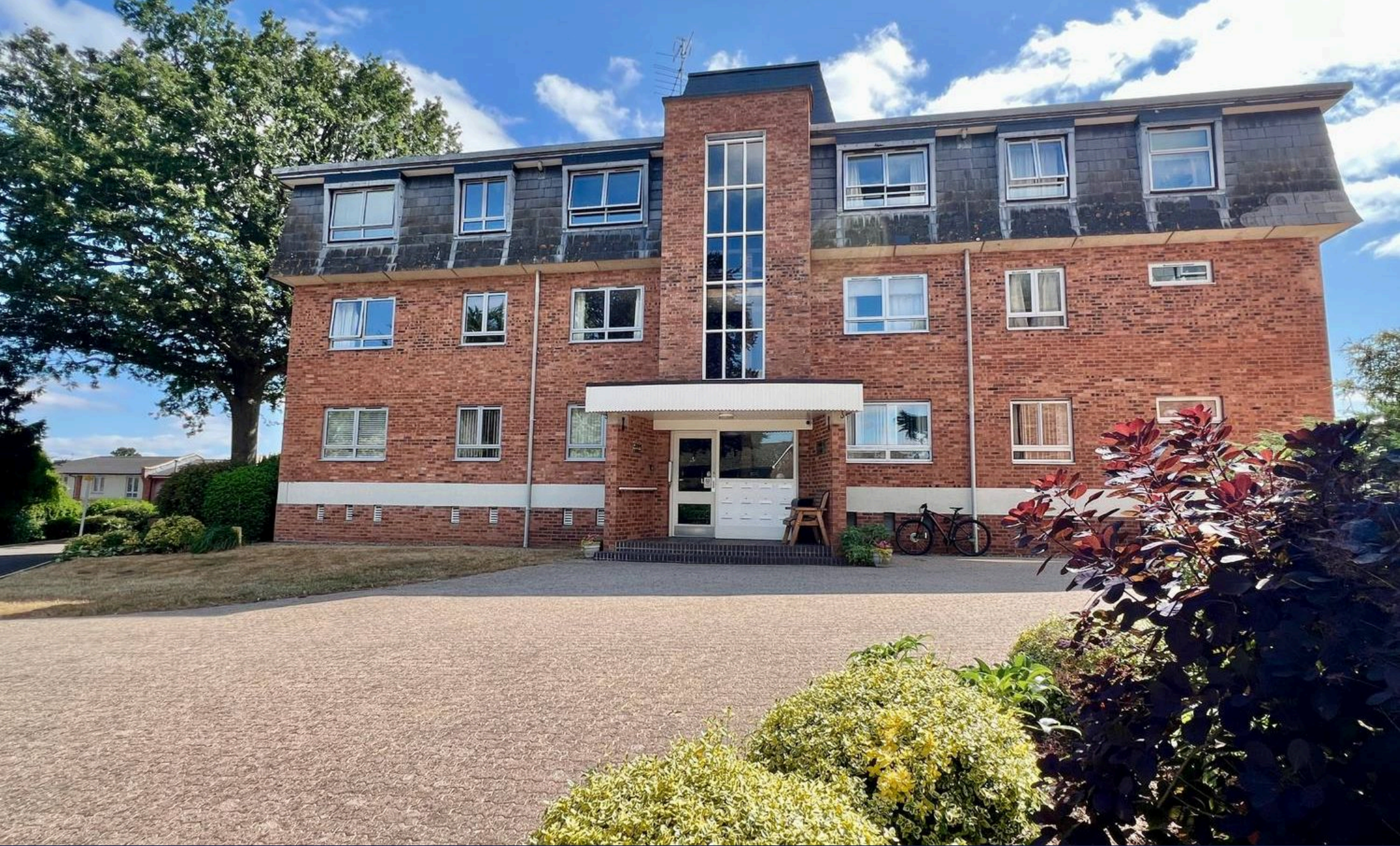
Flat 25, Compass Court, Compass Rise, Taunton, TA1 4PP £210,000