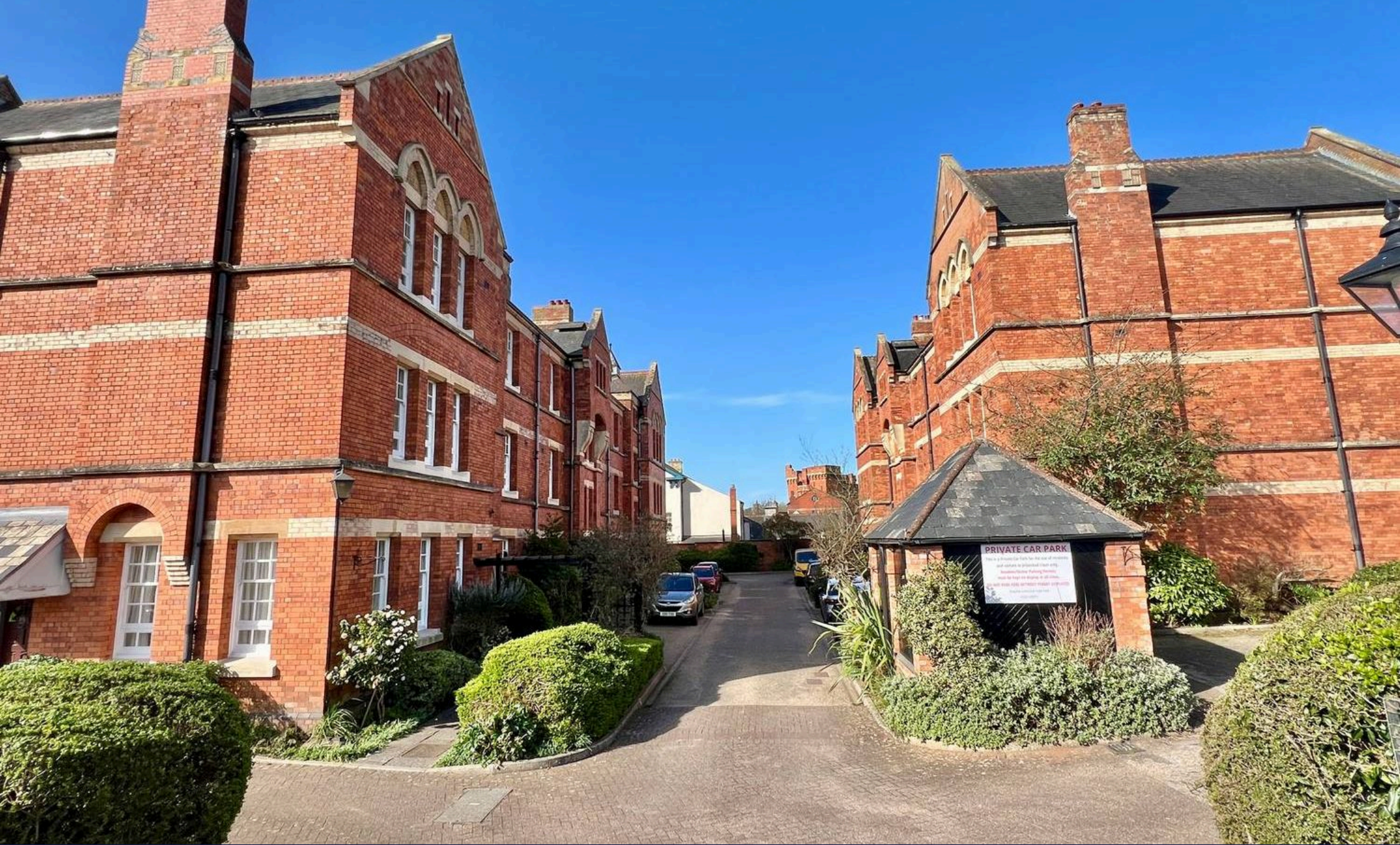
Flat 13, Jellalabad Court, The Mount, Taunton, TA1 3RZ £130,000