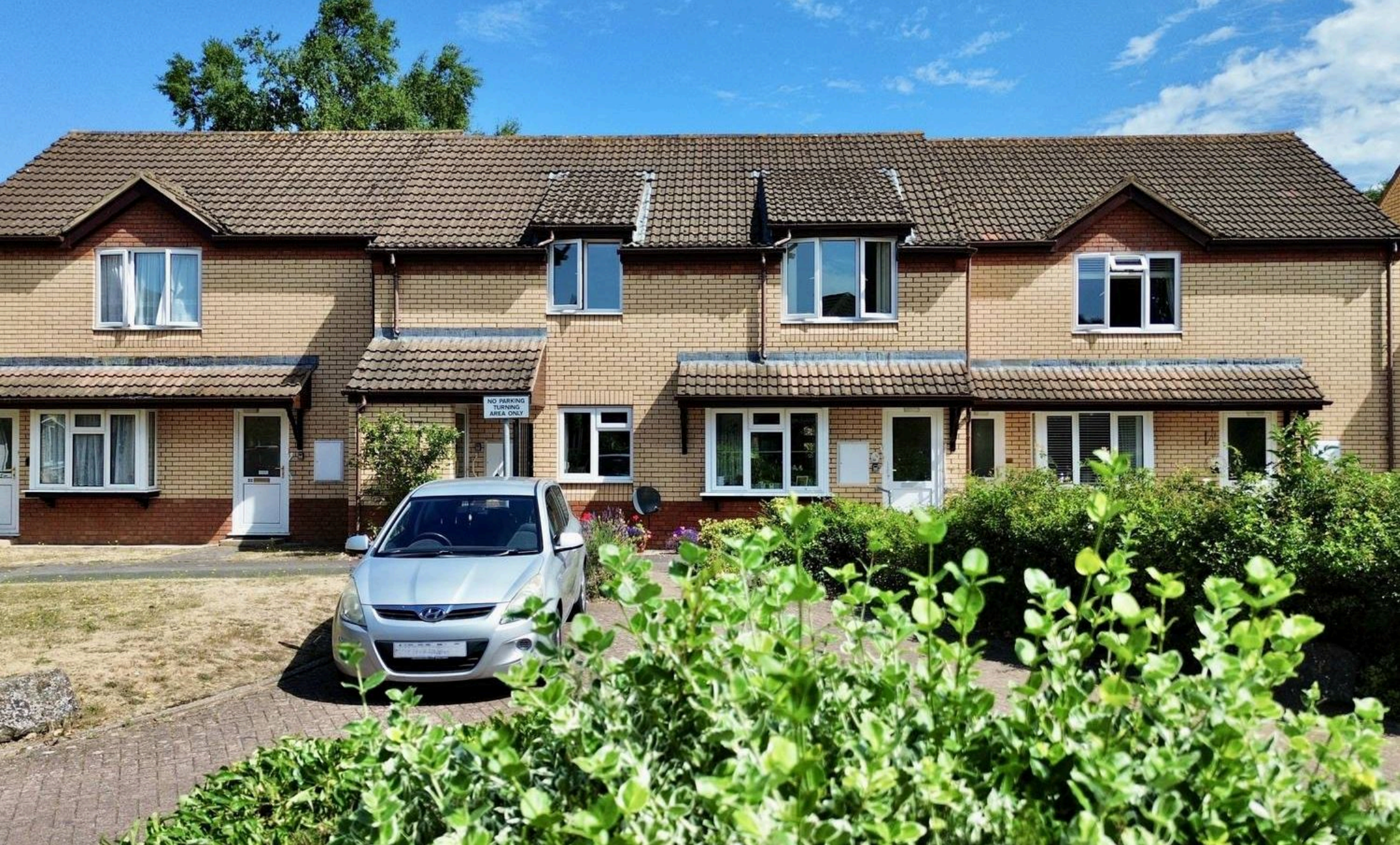
31 Northfield Gardens, Taunton, TA1 1XN £125,000