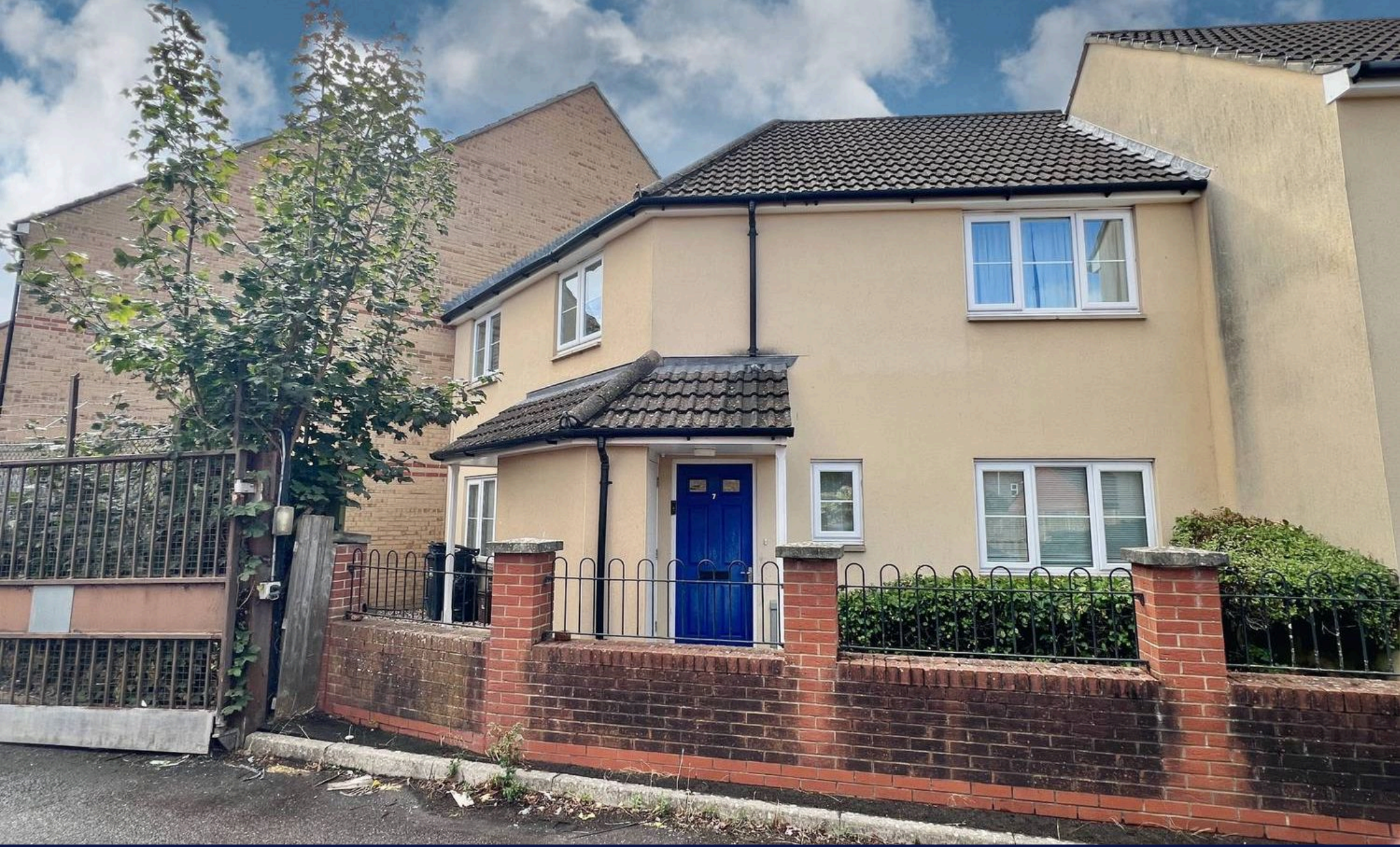
8 Northfield Court Pollards Way, Taunton £165,000