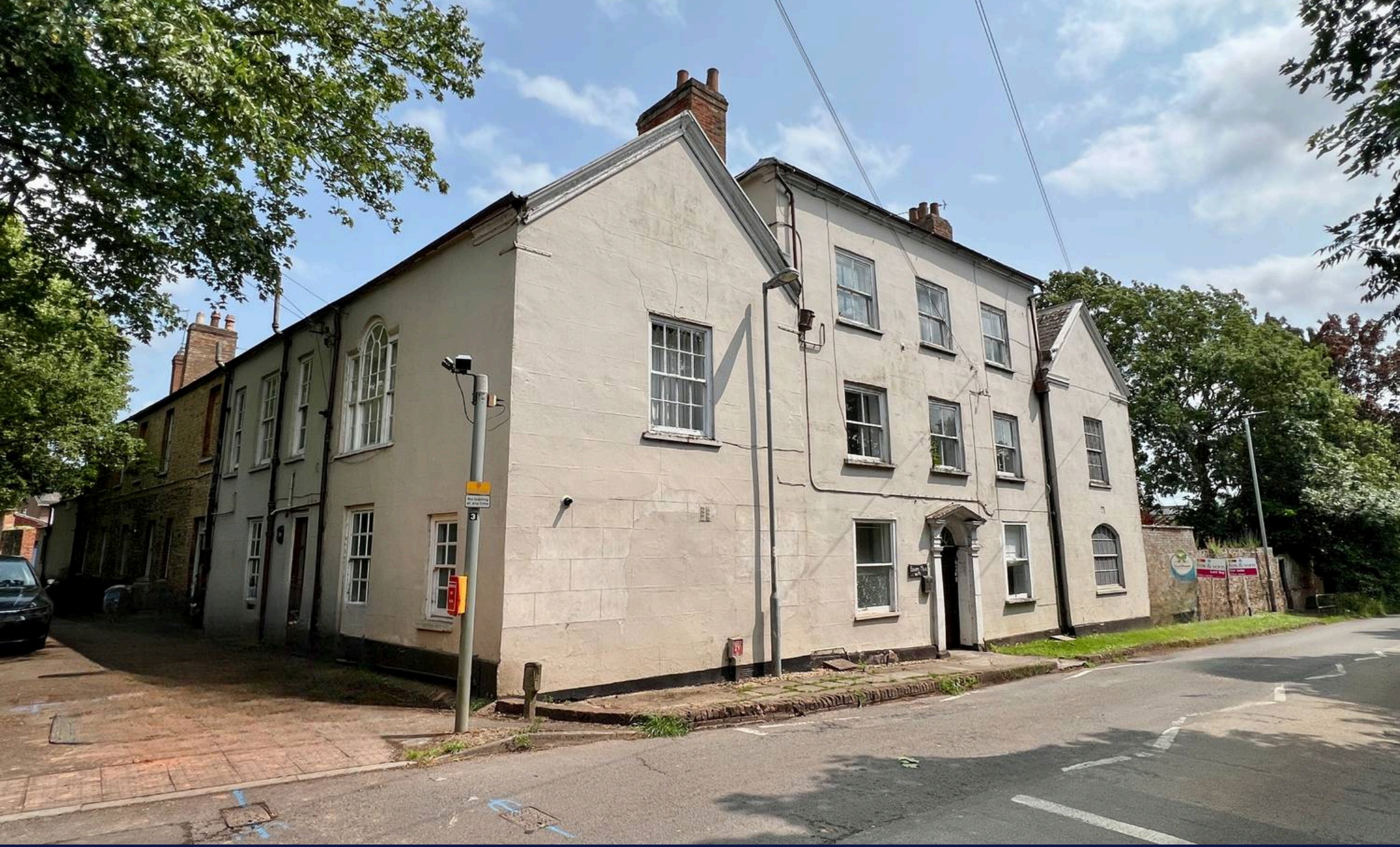
Flat 2c, Bishopsmead, 192 Kingston Road, Taunton, TA2 7NY £95,000