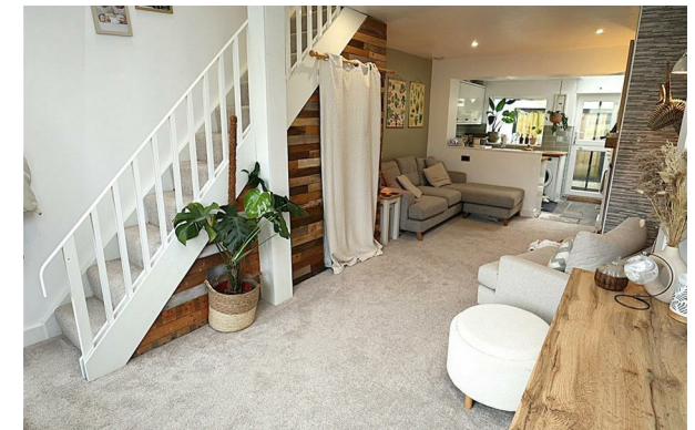
3 Dyehouse Cottage Hollin Lane, Sutton, Macclesfield, Asking Price £245,000