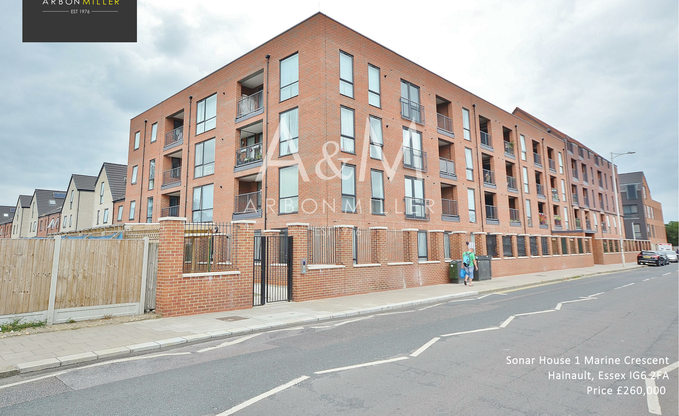
Sonar House 1 Marine Crescent Hainault, Essex IG6 2FA Price £260,000