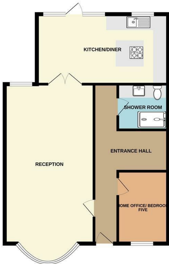
GROUND FLOOR 774 sq.ft. (71.9 sq.m.) approx.