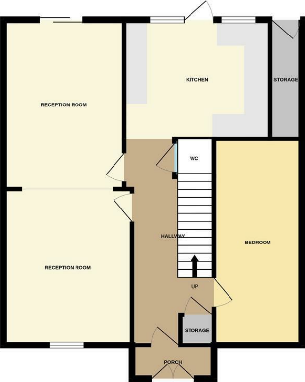
GROUND FLOOR 766 sq.ft. (71.1 sq.m.) approx.