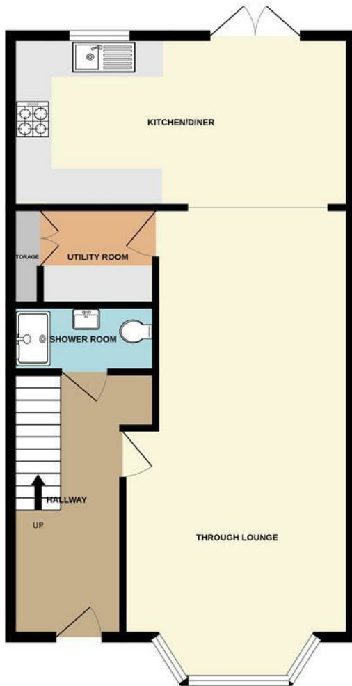
GROUND FLOOR 636 sq.ft. (59.1 sq.m.) approx.