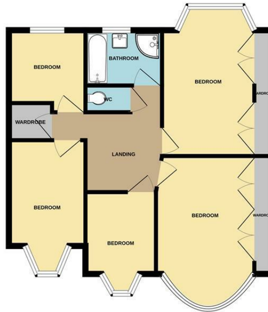
1ST FLOOR 617 sq.ft. (57.4 sq.m.) approx.