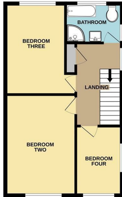
1ST FLOOR 479 sq.ft. (44.5 sq.m.) approx.