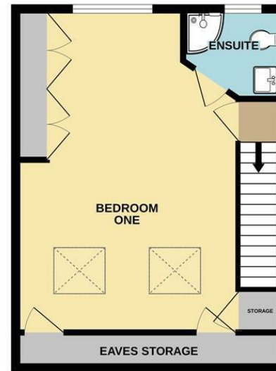
LOFT ROOM & EN-SUITE 392 sq.ft. (36.4 sq.m.) approx.

TOTAL FLOOR AREA : 1520 sq.ft. (141.3 sq.m.) approx. Whilst every attempt has been made to ensure the accuracy of the floorplan contained here, measurements of doors, windows, rooms and any other items are approximate and no responsibility is taken for any error, omission or mis-statement. This plan is for illustrative purposes only and should be used as such by any prospective purchaser. The services, systems and appliances shown have not been tested and no guarantee as to their operability or efficiency can be given. Made with Metropix ©2024