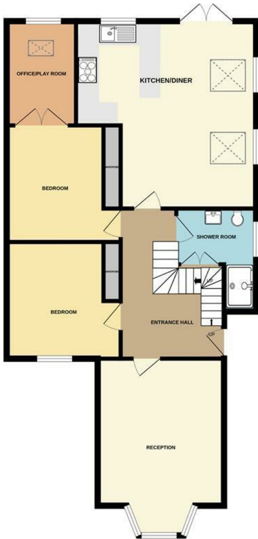
GROUND FLOOR 908 sq.ft. (84.4 sq.m.) approx.