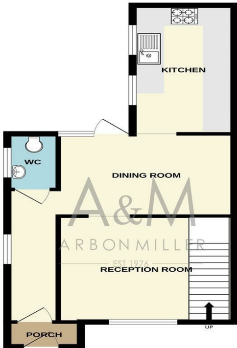
GROUND FLOOR 461 sq.ft. (42.8 sq.m.) approx.