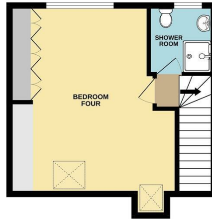
2ND FLOOR 341 sq.ft. (31.7 sq.m.) approx.