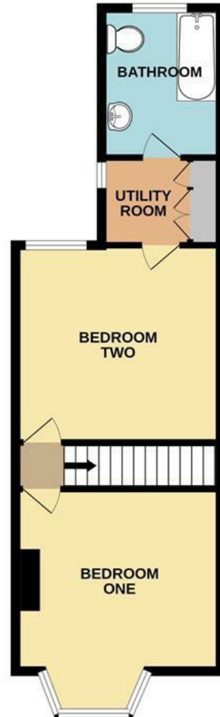
1ST FLOOR 432 sq.ft. (40.2 sq.m.) approx.

TOTAL FLOOR AREA : 940 sq.ft. (87.4 sq.m.) approx. Whilst every attempt has been made to ensure the accuracy of the floorplan contained here, measurements of doors, windows, rooms and any other items are approximate and no responsibility is taken for any error, omission or mis-statement. This plan is for illustrative purposes only and should be used as such by any prospective purchaser. The services, systems and appliances shown have not been tested and no guarantee as to their operability or efficiency can be given. Made with Metropix ©2023