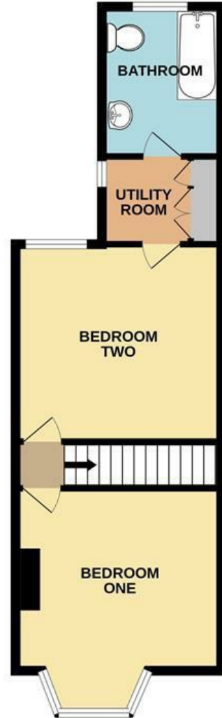
1ST FLOOR 432 sq.ft. (40.2 sq.m.) approx.

TOTAL FLOOR AREA : 940 sq.ft. (87.4 sq.m.) approx. Whilst every attempt has been made to ensure the accuracy of the floorplan contained here, measurements of doors, windows, rooms and any other items are approximate and no responsibility is taken for any error, omission or mis-statement. This plan is for illustrative purposes only and should be used as such by any prospective purchaser. The services, systems and appliances shown have not been tested and no guarantee as to their operability or efficiency can be given. Made with Metropix ©2023